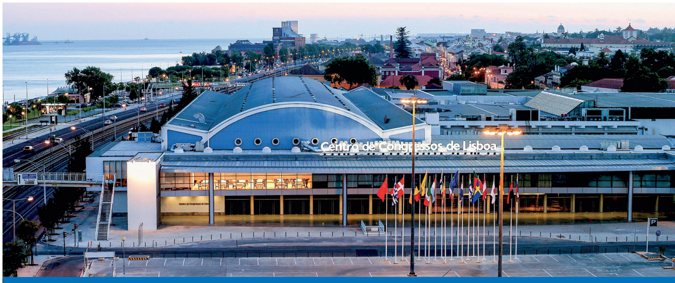
Lisbon Convention Centre.